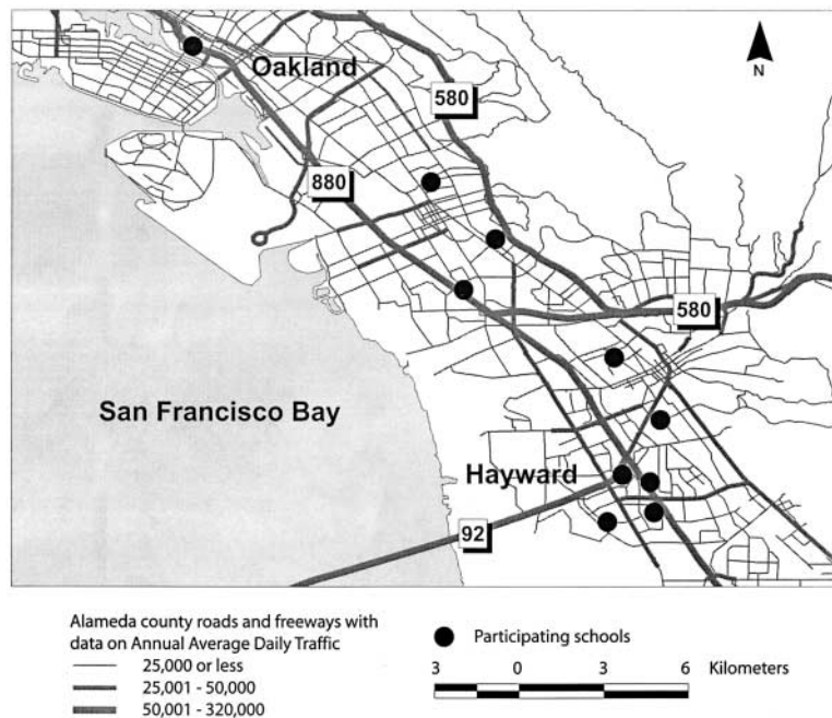
Figure 1. East Bay Children's Respiratory Health Study area. The study region is to the east and across the bay from the city of San Francisco.

in the fall (September–November) of 2001. \text{NO}_x and \text{NO}_2 were sampled during all weeks at each school. \text{PM}_{10} and \text{PM}_{2.5} and the BC concentrations were not measured every week. Study-averaged air pollution concentrations were calculated at each school by first normalizing the data to account for occasional missing values. Additional details are described in the online supplement and elsewhere (21). In preliminary analyses, we also used school location in relationship to prevailing winds and proximity to busy roads as an additional traffic metric.